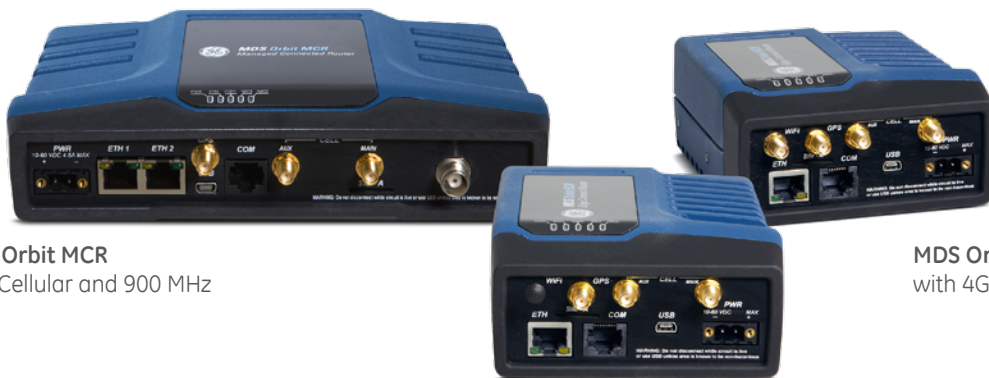
MDS Orbit MCR with Cellular and 900 MHz

A Wi-Fi radio option can be selected as a standalone, or as a secondary radio for licensed, unlicensed or cellular WAN-radios. Orbit's Wi-Fi is based on 802.11 b/g/n and supports speeds of up to 54 Mbps, and up to 7 clients/hosts per AP.